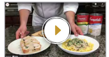
Canned Soup: A Speed-Scratch Hero