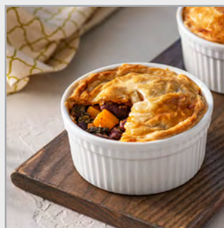
Veggie Pot Pie