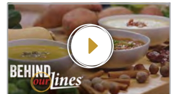
Behind Our Lines Video Series